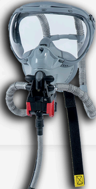
EROS® 40-Family Crew Masks