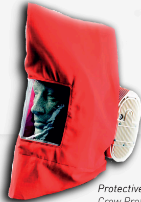
Protective Breathing Equipment Crew Protection from Hypoxia, Smoke & Toxic Fumes