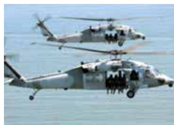
MARITIME PATROL AND SAR