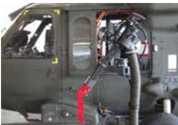
M134 WINDOW GUN PROVISIONS