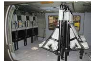
FOLDING TROOP SEATS (11)