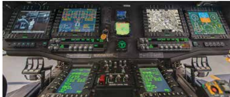
ADVANCED GLASS COCKPIT