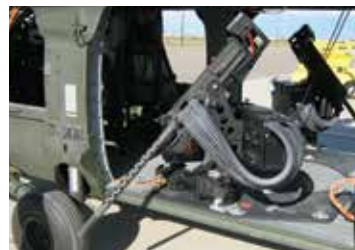
OPTIONAL INTERIOR GUN MOUNT (M3M .50 CAL SHOWN)