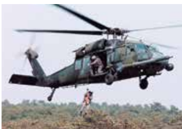
SEARCH AND RESCUE

The Sikorsky S-70i™ BLACK HAWK is ready now to deliver its legendary and best in class mission performance. Backed by a world class training and support infrastructure, the S-70i BLACK HAWK helicopter has been configured by our team of military aviation experts to deliver the right capabilities for the right mission. From basic utility, to advanced combat search and rescue missions, the BLACK HAWK is ready now.