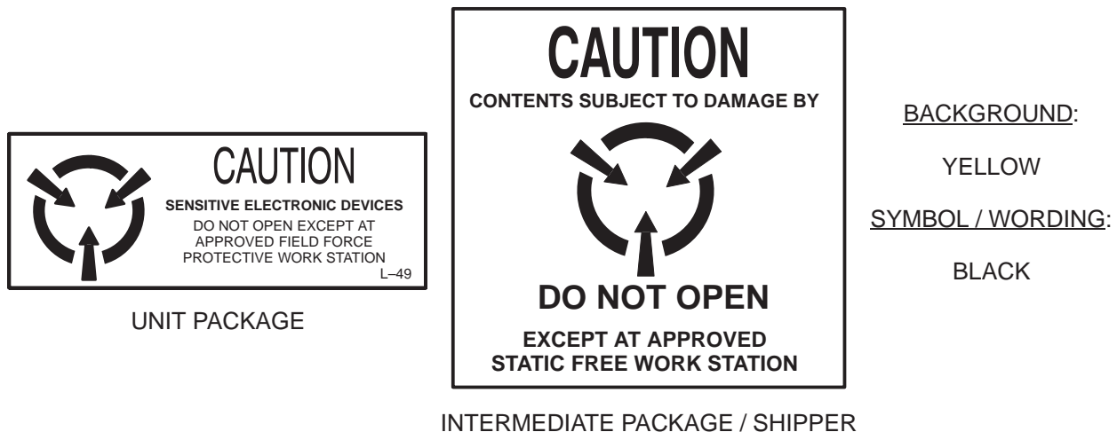
Figure 3. Electrostatic CAUTION Label

3.5.1.1 Electrostatic CAUTION Label – Apply WARNING label (Figure 31) to each unit package containing a static-sensitive device.