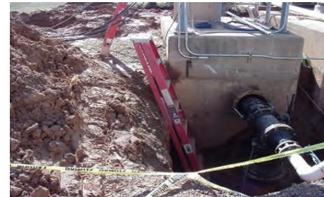
Not properly sloped, benched, etc.